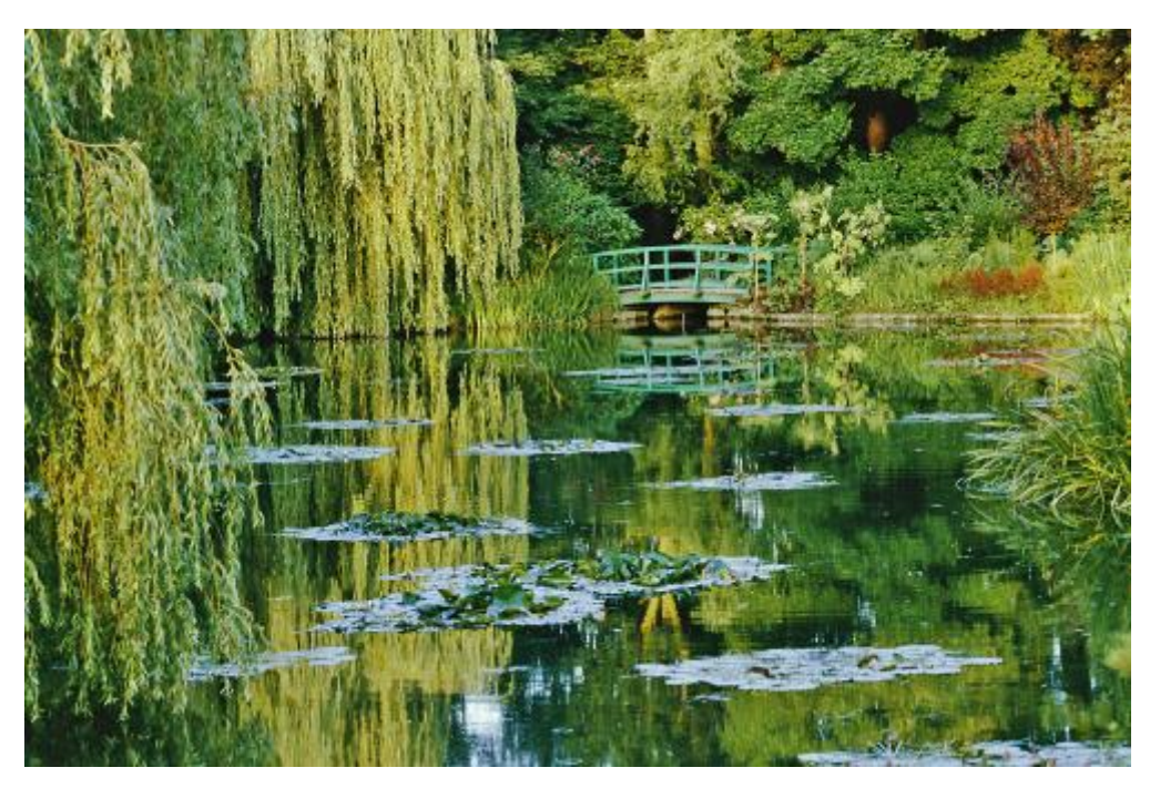
A stop-off at Claude Monet's garden at Giverny can be arranged as part of Château la Chenevière's tour

suites designed by Christian Lacroix. Visit in the autumn and you can also take in the new Yves Saint Laurent museum. Details A night's B&B with a three-hour personal fashion tour costs from €443 for two (00 33 1 42 74 10 10, hotelpetitmoulinparis.com)