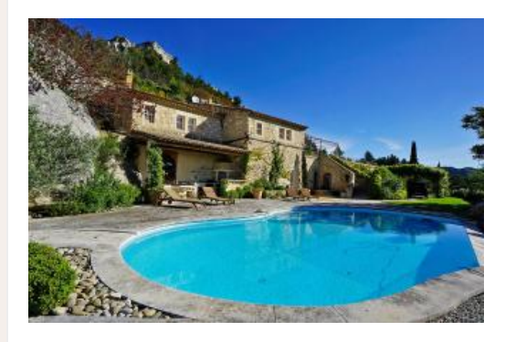
Les Rochers: a former Roman villa in the heart of the Luberon

Details Gîtes for four are from €100 a night or from €420 a week (00 33 476 38 90 50, <u>cabanecafe.com</u>). Fly or take the Eurostar to Lyons