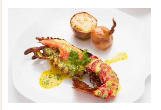
Enjoy a three-Michelin-starred dinner at Michel Guérard's heavenly spa resort, Les Prés d'Eugénie

Details The hotel's winter offer has a 30 per cent discount on room rates, so a superior room with a seven-course dinner and breakfast costs from €419 for two (00 33 3 80 49 02 29, <u>abbayedelabussiere.fr</u>). Fly to Paris/Lyons, then take the train to Dijon or Beaune