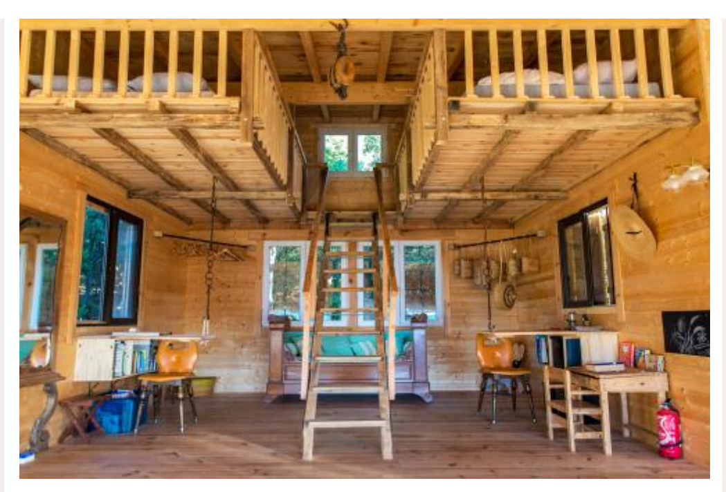
The off-grid Château dans les Chênes is surrounded by hilly forests and has a rainwater shower