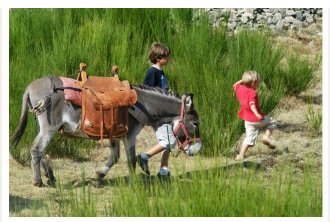
Take a placid four-footed friend for a ramble along the Rhône valley SAFRANTOURS