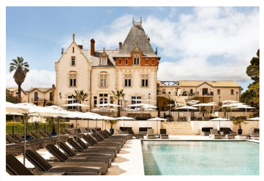
A hammam, aromatherapy sauna and infinity pool are on offer at the Château Saint Pierre de Serjac

Details A week in the Galathée holiday home costs from €1,050 for four (01903 879936, <u>sawdays.co.uk</u>). Fly to La Rochelle, or drive from northern ferry ports