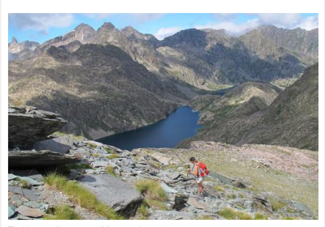
The Maritime Alps are a wildlife-spotter's paradise

Combine a boating and cycling holiday on this new eight-day cruise along the Loire. The round trip from Nantes goes to the coast at Saint-Nazaire, on to the city of Angers, the many châteaux of the Loire Valley, and Saumur. Guests can enjoy guided cycle rides before relaxing on board the Loire Princesse . The ship is the only river cruise ship that can navigate the shallow waters of the Loire, so this trip is one of a kind. Details The eight-night cruise and bike trip costs from £1,949pp and includes all meals and drinks, bike hire and shore excursions, but not flights to Nantes. (020 8328 1281, croisieurope.co.uk)