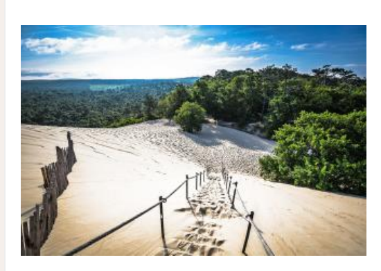
Dune du Pyla — Europe's biggest sand dune — in Arcachon Bay

plentiful seafood, local cider and the flavoursome pink onions that were made famous by the beret-clad "Onion Johnny" sellers, it's the perfect place to indulge before stocking up on supplies to bring home. The Michelin-starred restaurant at the Brittany hotel offers the perfect view of the fishing harbour and the Île de Batz, while the hotel has 11 modern suites offering equally stunning views from their private gardens or terraces. Details Doubles cost from €140 a night; sea-view suites from €290 (00 33 2 98 61 13 29, <a href="https://hotel-brittany.com">hotel-brittany.com</a>). Take the ferry to Roscoff, or fly to Brest