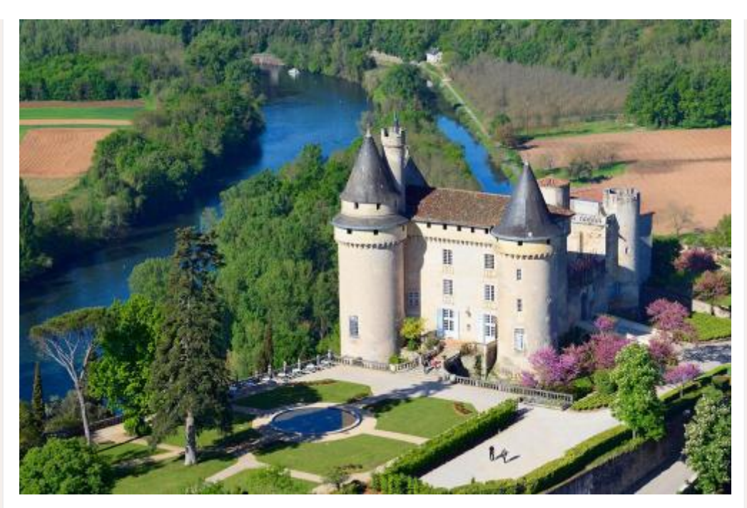
Head to Château de Haute-Serre for tastings of its delicious wines