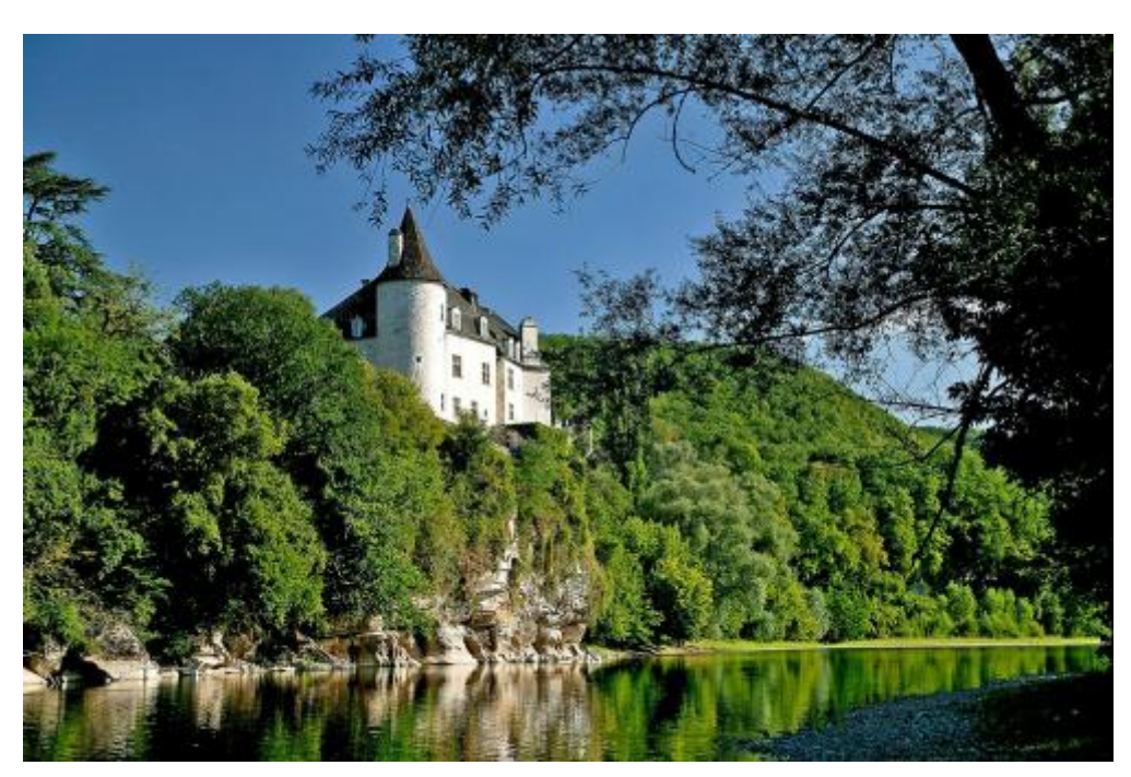
Cast off on the Dordogne at the Château de la Treyne

Details The Festival des Roses is on May 27-28 (<u>chedigny.fr</u>). Doubles cost from £95 a night, breakfast £5pp, or seven nights in the apartment for six costs £800 (00 33 2 47 92 55 88, <u>loire-chateau.fr</u>). Fly to Tours