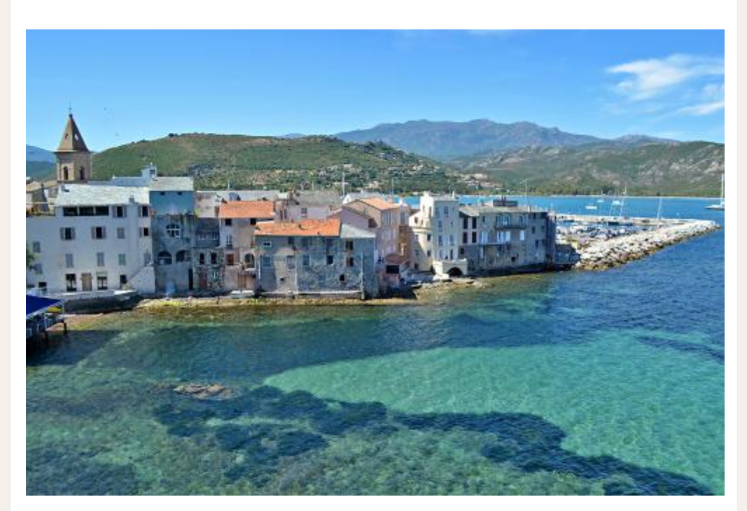
Take in the coastal paths and pretty villages of northern Corsica on a week-long walk

Details Two nights' B&B costs from €850pp, including one dinner in the Bistrot restaurant, access to the spa, a guided half-day bike tour and bike rental for two days (00 33 4 90 74 71 71, coquillade.fr). Fly to Marseilles