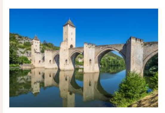
The Pont Valentré, near the medieval town of Cahors

Details Tents sleep two or four people and cost from €59 a night, breakfast €8.50pp (00 33 6 65 45 60 89, laboiteapoissons.fr). Take the ferry to St Malo or Caen, or fly to Rennes or Brest