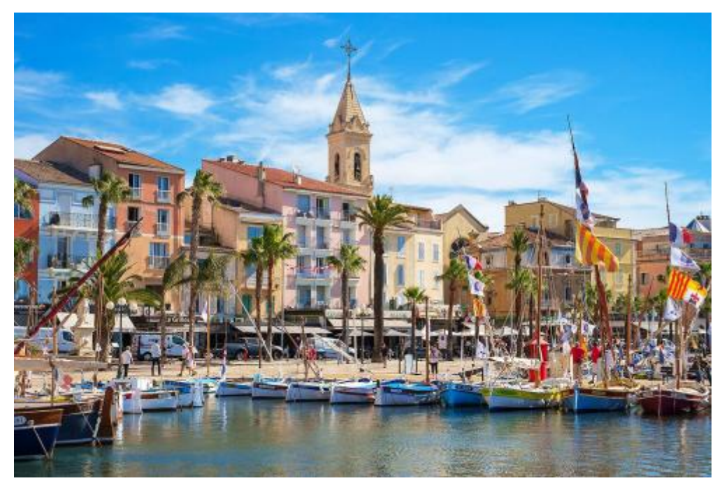
A visit to Sanary-sur-Mer is part of Hostellerie Bérard's Art de Vivre en Provence package