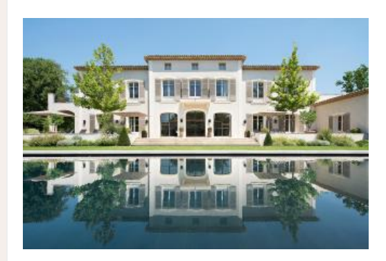
The La Bergerie villa sits in the hills above the Côte d'Azur

Details Hotel rooms are from €220 a night B&B, apartments cost from €178 a night, and the kids' club is €150 for five half-day sessions (0345 6866505, <u>serjac.com</u>). Fly to Béziers or Montpellier